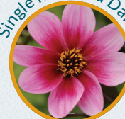
Single flowered Dahlia